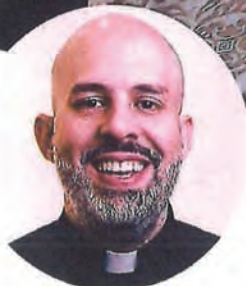
Bishop Joseph Espaillat